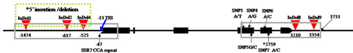
Fig. 2 Maize PSY1 gene. Translated exons are depicted as black boxes and putative start of transcription (TSS) and polyA sites are indicated. Gray rectangles show regions sequenced in 129 temperate yellow lines, red triangles indicate InDels. Positions of polymorphic sites relative to sequence alignment are indicated numerically with polymorphisms

according to yellow maize line B73. Polymorphisms found by aligning sequences of 129 temperate yellow lines are marked in diagram and those that are significantly associated with changes in measured phenotypes are labeled with asterisks. The 5' insertion/deletion variation includes InDel1, InDel2, and InDel4 (color figure online)